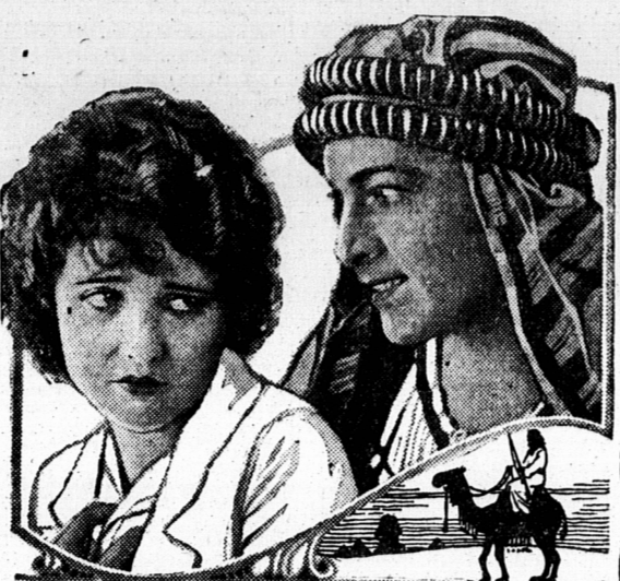
Agnes Ayres and Rudolph Valentino in a Scene from the Paramount Picture, 'The Sheik', a George Melford Production.