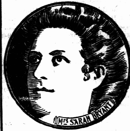
months' use of the medicine restored her to perfect health.