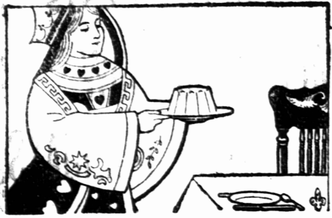
A dessert fit for a queen.

Strong north westerly winds, fair and cool.