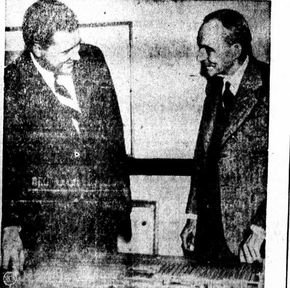
Henry Ford, 82-year-old founder of an automobile model of the Detroit Rouge plant to his grandson, Henry Ford II. Young Ford has just been announced as successor to his grandfather as President of the Ford Motor Company.