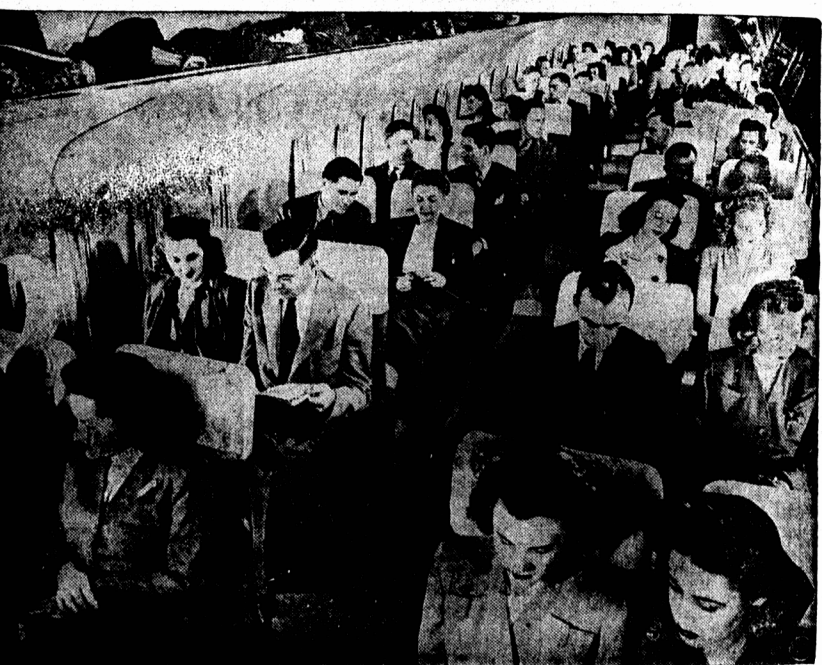
No, air—the scene above is NOT the interior of a super-cooper railway coach. It's the passenger compartment of Boeing's new double-decked Stratocruiser, the latest word in airborne luxury travel. In this section, 56 passengers lounge in upholstered, widely spaced seats. Eight more passengers can fit in another compartment and an additional 14 can be accommodated in a lower-deck lounge for a total of 81. Photo below shows how seats are made up into full-sized upper and lower berths, of which there are 26 in the main section.