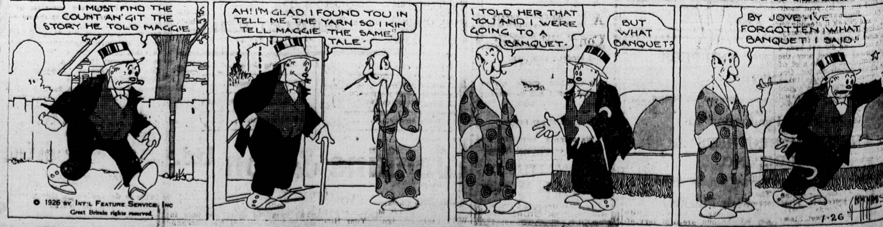
BRINGING UP FATHER—BY JOE BEVINS