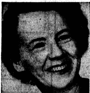
ON EDGE ALL THE TIME . . . because I forgot one simple fact. Then I tried Kellogg's 30-day test. That simple change of diet really helped me keep fit . . . feel grand during working hours, too!

and how downright good Kellogg's Bran Flakes TASTE!