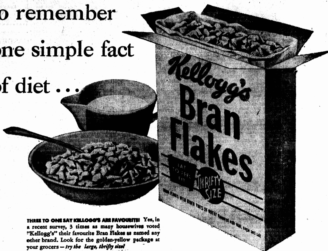
THREE TO ONE SAY KELLOGG'S ARE FAVORITE! Yes, in a recent survey, 3 times as many housewives voted "Kellogg's" their favorite Bran Flakes as named any other brand. Look for the golden-yellow package at your grocers - try the large, thrifty size!

The famous 30-day test has convinced thousands how important it is to remember one simple fact of diet . . .