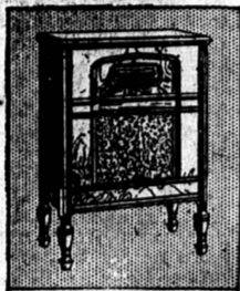
VICTOR RADIO CONSOLE R-32 $255 (Complete with tubes)

The Greatest Achievement in Radio History!