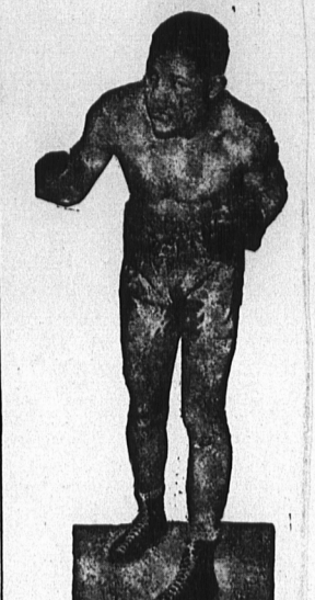
JOE LOUIS (Heavyweight Champion)

LOUIS-BAER FIGHT AT PRINCE EDWARD THEATRE FRI-SAT.