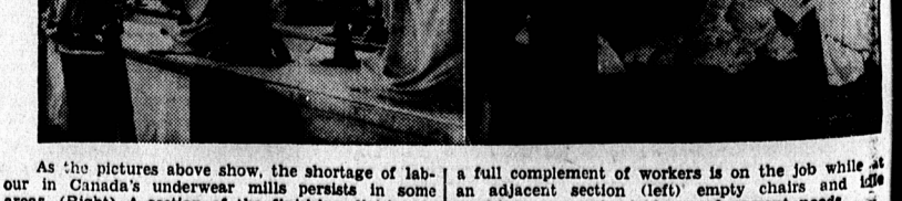
As the pictures above show, the shortage of labor in Canada's underwear mills persists in some areas. (Right) A section of the finishing division in a Woodstock, Ontario, underwear knitting mill. Here, a full complement of workers is on the job while all machines are mute evidence of present needs.

A. By molding into an oblong shape, placing on a platter and arranging sliced white of eggs, as daisy petals, around it. The yolks are put through a strainer and piled up to make daisy centers.