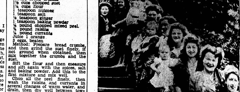
Here are a few of the 1200 Australian wives and children of American fighting men who hopefully await the day when they can come to America. Jamming Australia's port cities in hopes of obtaining entry passage, many of the wives will have to wait a year before they will be able to see their future home in U. S. A.