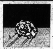
A highly magnified gritty particle... ORDINARY GRITTY CLEANSERS SCRATCH LIKE THIS