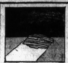
A highly magnified Old Dutch Cleanser particle... OLD DUTCH CLEANSER CLEANS LIKE THIS