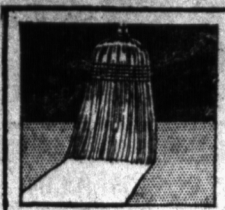
YOU USE A BROOM THAT SWEEPS LIKE THIS