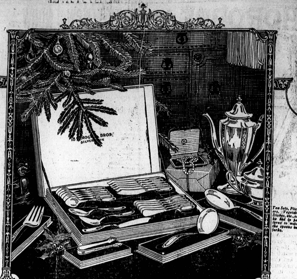
Tea Sets, Plectrums, Vegetable Dishes, etc.—can be had in sets to match the spoons and forks.

...year for ten... opportunity rush to the polls and vote for "the best of all Governments!"