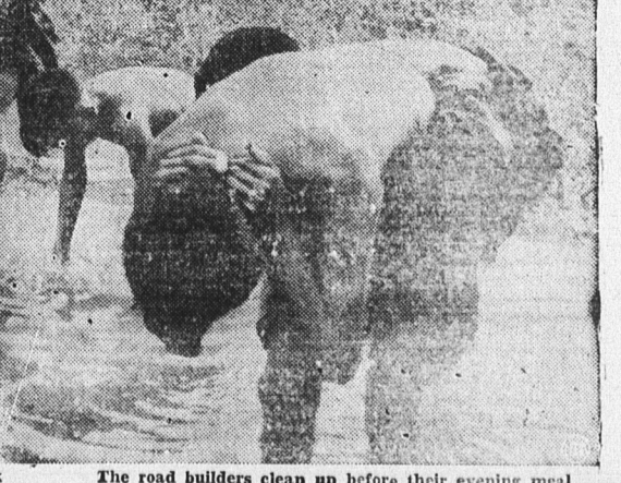
The road builders clean up before their evening meal