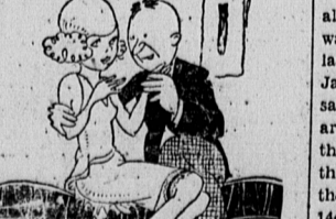
She: Why do you call me Pearl? My name's Helen. He: Well, you're so easy to string.