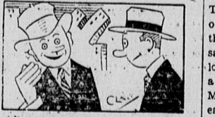
"I'm going to the bank to get my balance." "Shouldn't you go to a nerve specialist for that?"