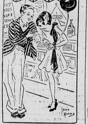
"The girl who is interested in light sports generally follows the fair steppers."