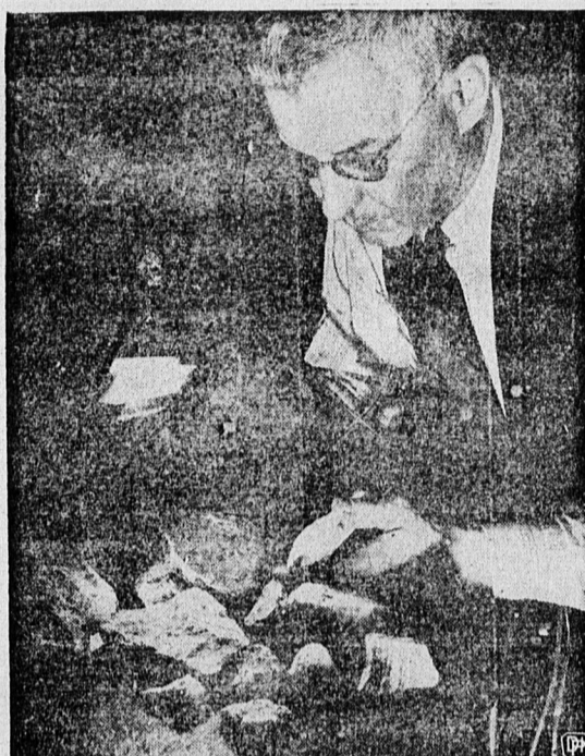
Ultra violet rays are used to detect the metal, and portable lamps are now being made for the modern prospector. As illustrated here the tungsten glows whitely under the violet rays, while the rest of the scheelite ore remains dark.

hand and freight it to Ottawa, they actually lose money on it.