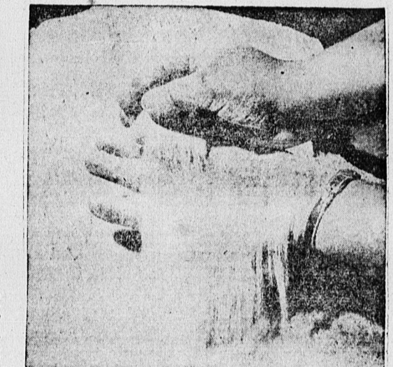
This is tungsten concentrate, fresh from the mill. Used as a hardening agent in the manufacture of tool steel, it is added to the melting pots in this form. Canada and the United States have been largely dependent upon China for their tungsten. The Mines Bureau has already produced more than thirty tons—enough for a great number of tools so vital to the war industries of the country.