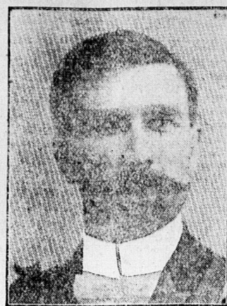
C. A. WILSON, M. P., of Laval, Que., who was elected as the member for Laval during the past elections.