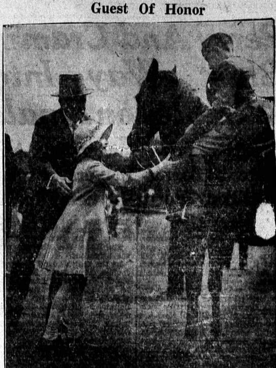
Little Princess Elizabeth was the guest of honor on children's day at the Richmond, England, horse show, the other day. Here she is seen presenting a rosette to a prize-winner.