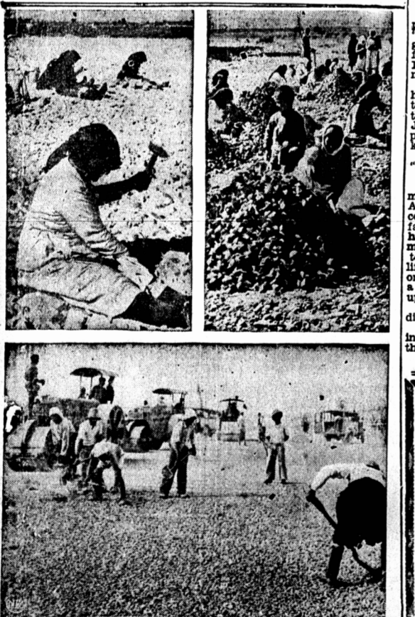
Cradle rockers turn rock crushers on Cyprus to keep British airfields on that Mediterranean island in top shape. Native women make "little ones out of big ones," then pile up the rocks for transport to the airfield, where steam rollers level the surface.