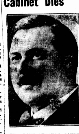
THE LATE SENATOR SAUVE

MONTREAL, Feb. 6 — (CP) — Senator Arthur Sauve, postmaster general in the Conservative cabinet of Rt. Hon. James B. Bennett, died in hospital here today after a long illness. He was 69.