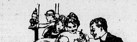
Find increasing prosperity—