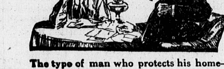
Will, as the years pass by—