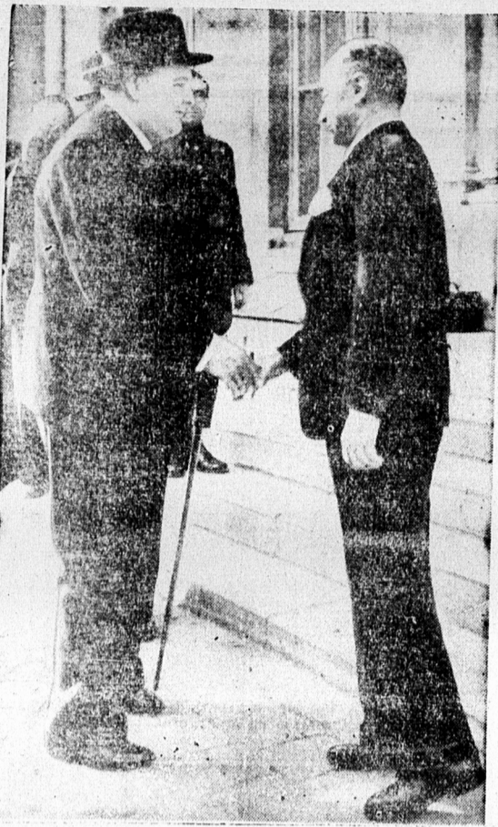
Britain's "man of the hour," Winston Churchill, and dynamic Premier Paul Reynaud of France smile with grim confidence in a warm handshake as they left a recent meeting of the supreme Allied war council in Paris. The battle of Flanders had been lost and the outlook was none too bright, but the confidence of the two great Allied leaders remained unshaken.