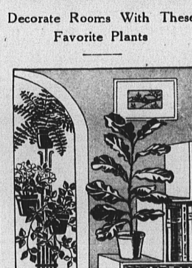
Lovely But Good-Natured

What a rapturous tonic against winter gloom—grassy greenery glimpsed through a doorway, sturdy cheerful plants brightening an otherwise dull corner. You have only to know a little about plant-arranging to create such pictures anywhere in your home.