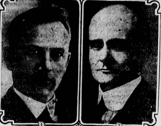
REPRESENTED BY FAMOUS LAWYER