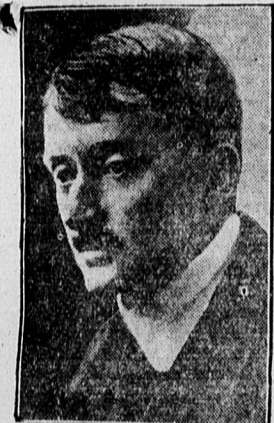
POET LAUREATE COMING

John Macfield, poet laureate of England, who is coming to Canada, landed in New York recently with his wife. If conditions had not been so unpleasant in a certain American rug factory, the poet might have been a New York physician, he told reporters. Working in the factory he decided he would become a doctor, but his surroundings were so terrible he fled to England. Just before he started he ran across a book of Chaucer's poems: that is what led him to becoming a poet, he said.