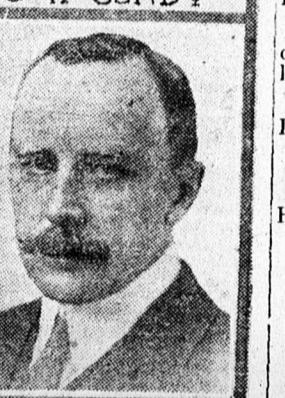
SIR AUGUSTUS NANTON