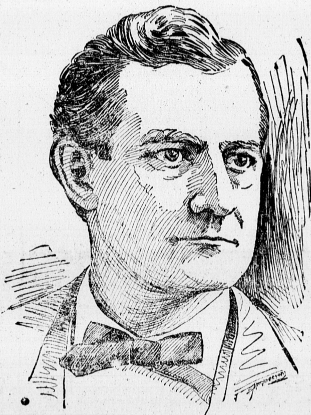
W. J. BRYAN, politician now touring in Western Canada. The great American debater in Canada.

Who calls these styles pretty? Certainly men do not, and it is the men whom these women are trying to attract by the shameless display. How these women navigate with their waist lines dropped to their knees is a question which I will not attempt to solve. I certainly do know that they walk like hopped ponies and if there is any charm in that I fail to see it.