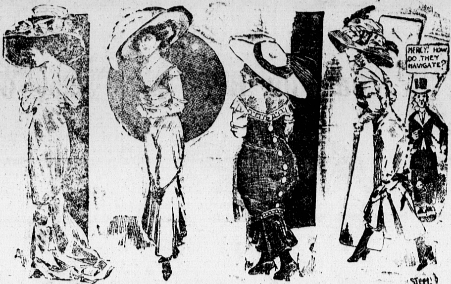
TYPES SKETCHED FROM PHOTOGRAPHS FROM NEW YORK SHOWING WHAT MISS GREY CALLS THE "SHAMELESS DISPLAY."