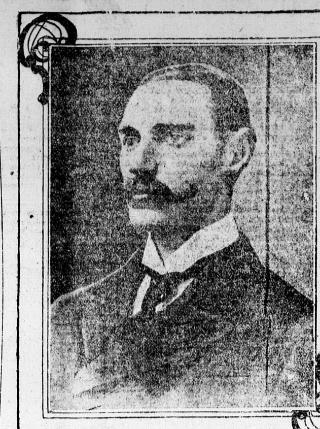
JOHN JACOB ASTOR