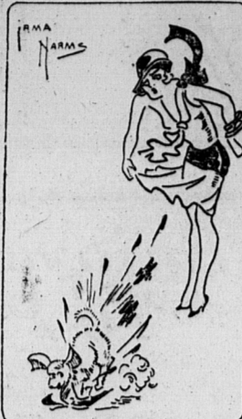
"Everybody resents a dirty dig."