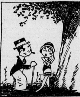
"Why did he shake the farmer's daughter?" "He said she harrowed his feelings too much."