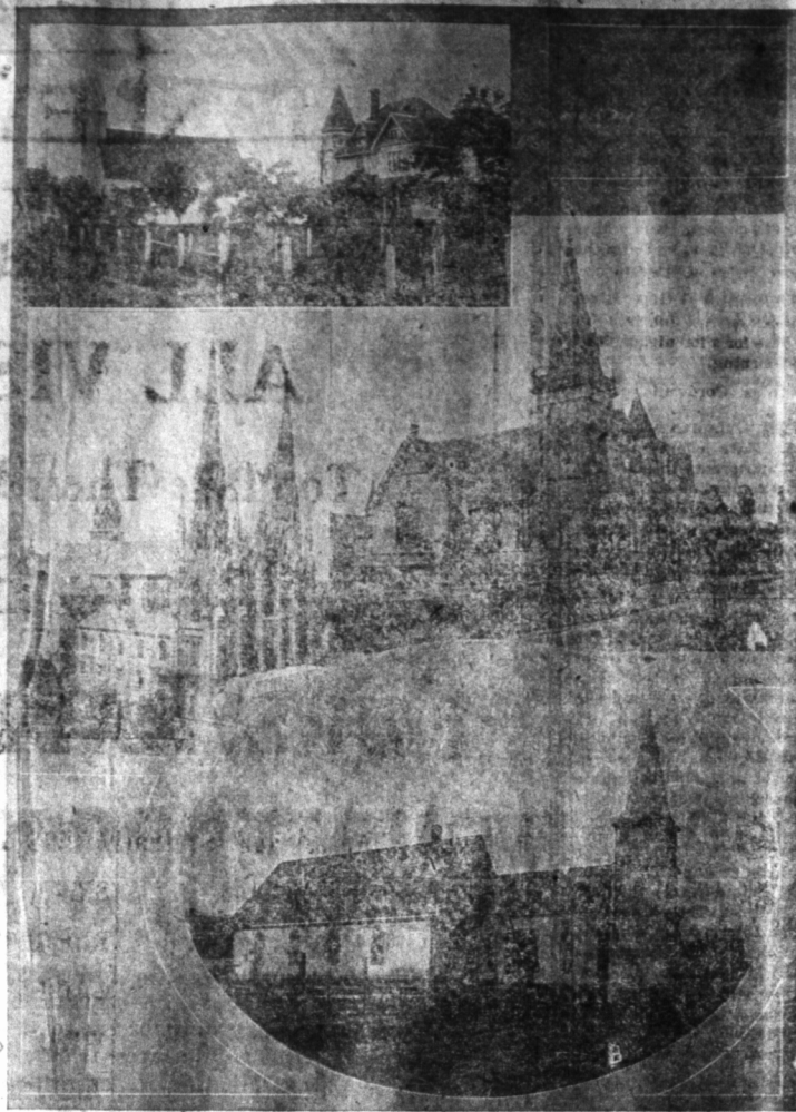
TWO SUMMERSIDE CHURCHES WHICH ESCAPED DESTRUCTION

are the most reliable garments in the trade, the materials are thoroughly shrank ensuring a permanent shape and fit. Ask for Britannia Coats and Skirts.