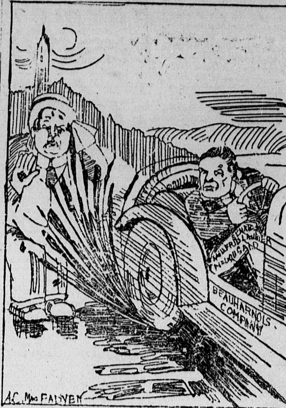
HON. W. L. M. KING—"To think that my dear friend Wilfrid would do this to me."