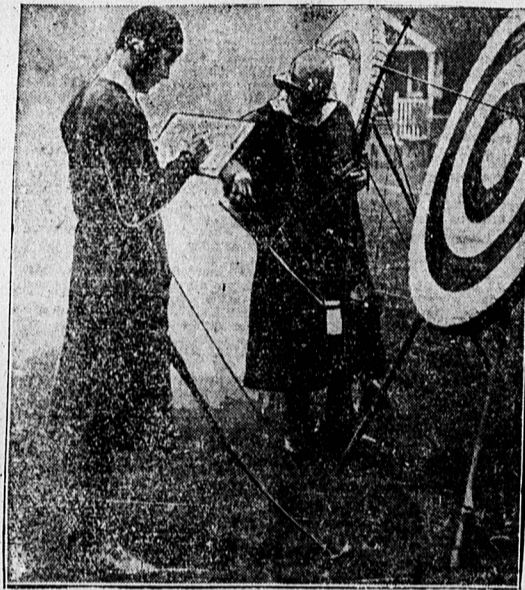
ROYAL TOXOPHILITE SOCIETY HOLD MEET

Here we see J. A. Mollison, flying record holder, wishing Kingsford-Smith farewell as the Australian prepared to leave for home, following his severe attack of sunstroke while attempting to break Mollison's record for the Australia-England flight. Doctors have warned Kingsford-Smith against making any flights for some time to come.