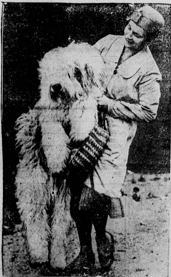
SEEN AT LONDON, ENGLAND, DOG SHOW

M. and Mme. Andre Citroen of Paris, France, are visitors to America, M. Citroen, who is France's most famous automobile manufacturer, having crossed the ocean to attend the eighth conference of major industries. During the past week the visitors were entertained in Detroit, where they inspected the Ford motor plant.