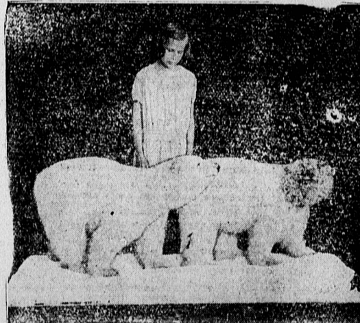
COLLECTED BY SIR HUBERT WILKINS

Are you in a hurry? Do you find rubber boots, gaiters and hip waders cumbersome? Try these. They're zipper-equipped and guaranteed not to stall. As seen at London, England, fair.