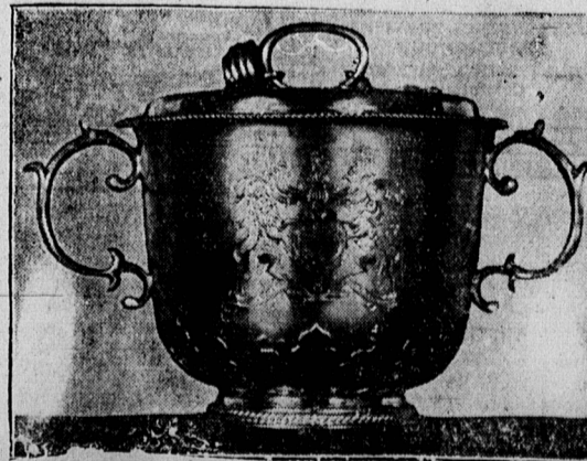
FOR INFANT SON OF GOVERNOR-GENERAL

Before leaving for China to conduct their flood relief surveys, Colonel and Mrs. Charles A. Lindbergh flew from Kasumigaura naval air-drome, Ibaraki, Japan, to the Kitsugawa airport, Osaka, Japan. The Lindberghs are seen ABOVE leaving the ancient Nijo Palace, Kyoto, Japan, which they visited after arriving at Osaka.