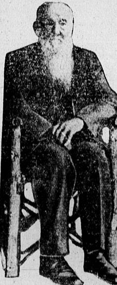
"DAD" HALE AT 94

Two polar bear cubs, recently placed on exhibition in national museum at Ottawa, were born on Banks Island far beyond the Arctic circle. When eight months old they were collected in 1914, by Geo. H. Wilkins, now Sir Hubert, then a member of Canadian Arctic expedition of 1913-1918.