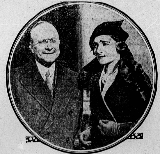
"FRENCH HENRY FORD" AND WIFE VISIT AMERICA