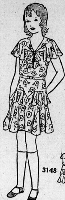
The chic little Parisienne has taken up the vogue for peplums. And how fascinating!

Just a wisp or so of printed sheer dimity is all you need to make this cute dainty affair.