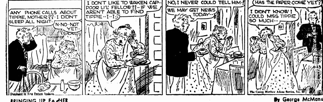
BRINGING UP FATHER