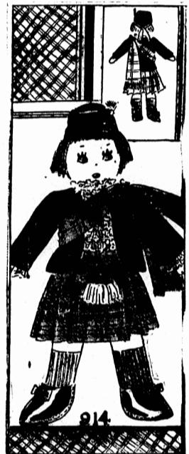
DESIGN NO. 914

A Scotch doll made at a small cost. An ideal gift for a youngster. The finished doll stands about 12 inches high. Pattern No. 914 contains complete instructions for making the body of the doll, clothes, wig and shoes. To order pattern: Write, or send above picture with your name and address with 15 cents in coin or stamps to Needlework Bureau, Charlottetown Guardian. Design No. 914 NAME _____ STREET ADDRESS _____ CITY _____ PROVINCE _____