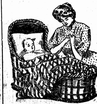
Sufferer of Twenty Years States Dr. Hamilton's Pills are a Real Cure.

You Can Enrich Your Worn-out Blood and Quickly Renew Your Health With Dr. Hamilton's Pills.