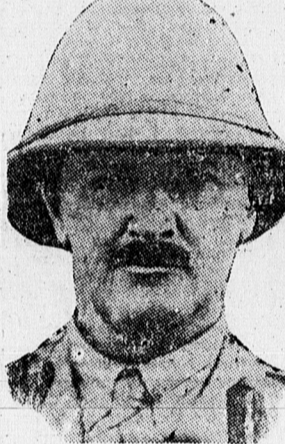
Lord Allenby, is the British representative in Egypt, who delivered the British Ultimatum.