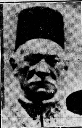
Zaghoul Pasha, Premier of Egypt, has resigned over the British Note.