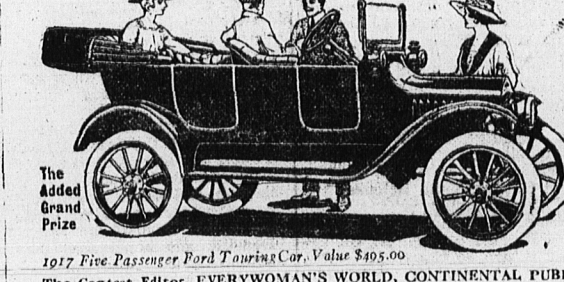
1917 Five Passenger Ford Touring Car, Value $495.00 The Contest Editor, EVERYWOMAN'S WORLD, CONTINENTAL PUBLISHING CO., LTD., 24 Continental