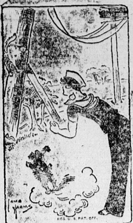
"A polecat to any feline pursued by a common cur."