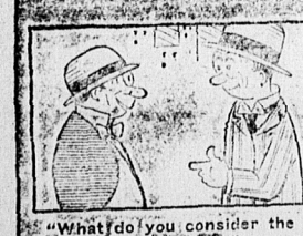
"What do you consider the first sign of a coming age?" "Getting mad when anybody calls you old."

If time is money, some fellows try their best to turn the clock. And that is why they always buy on tick.