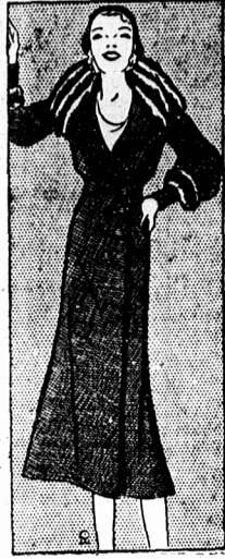
Richly Furred COATS $17.50 to $67.00

Satins, crepes, light woollens and new patterned silks are here.