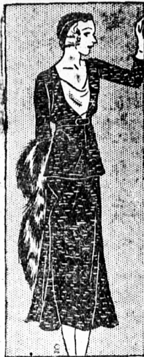
Smartly Styled DRESSES $6.75 to $27.50

Satins, crepes, light woollens and new patterned silks are here.