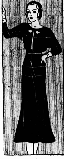
Clever, Fall SUITS $7.95 to $21.00

New rough woools cut in the straight line. Wolf and Fox collars.