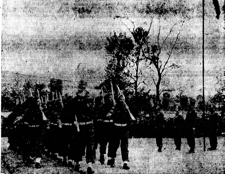
With Canadian headquarters set up in France, Lt.-Gen. H. D. G. Ore is shown taking the salute.—(Can- sol on Dominion Day. Here Lt.-Gen. H. D. G. Ore is shown taking the salute.—.