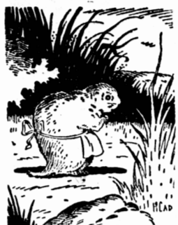
Soon she heard that sound again. It was a little louder.

He knew he was the thumper because right there in front of her he thumped with the longest, biggest hind feet she ever had seen.