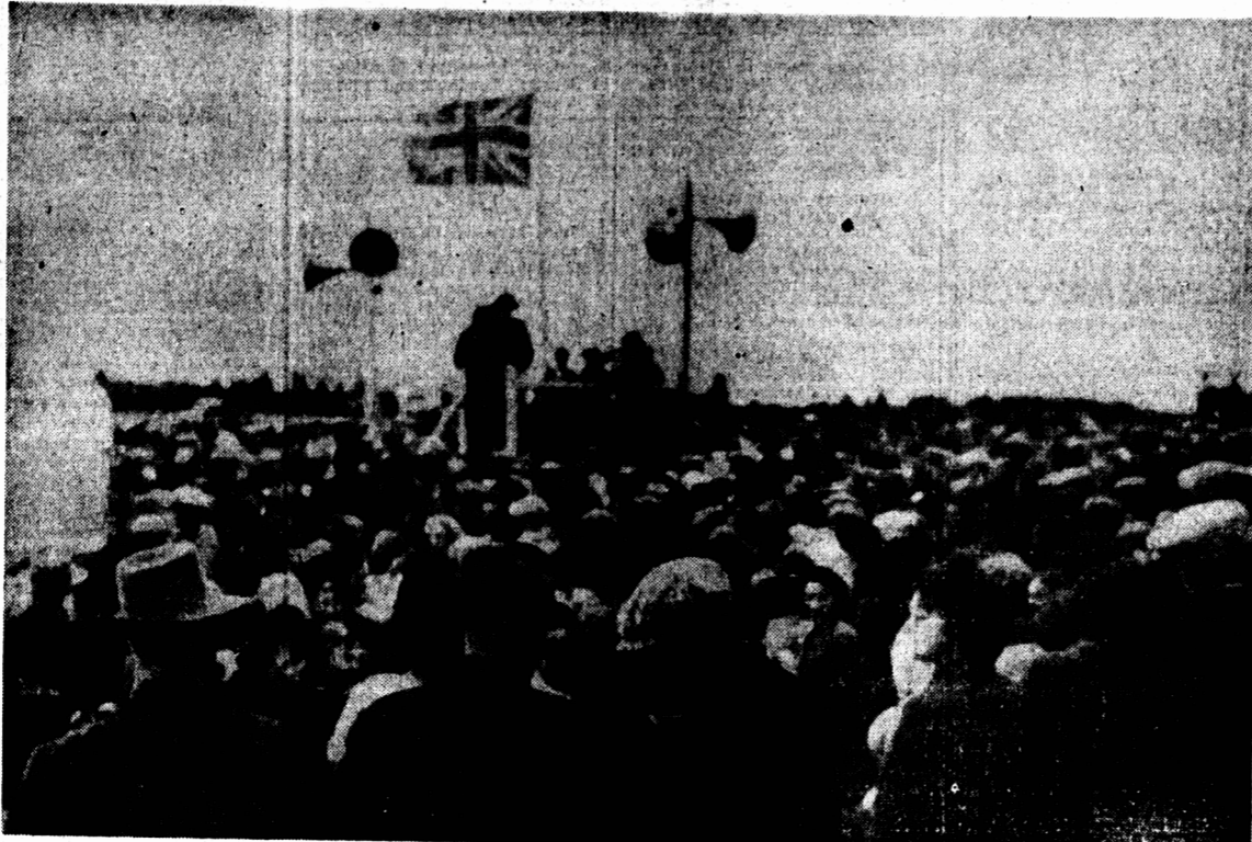
Part of the large crowd shown around the new step-dancing platform. The step-dancing competition Match and Horse Show held at Dundas on September 21. Rain attractions, failed to dampen the crowd's enthusiasm for the wide variety of