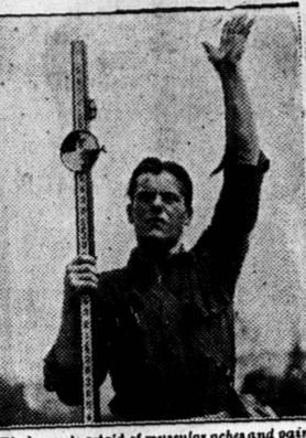
Find a way to get rid of muscular aches and pains

An Oil that is Famous. — Though Canada was not the birthplace of Dr. Thomas' Electric Oil, it is the home of that famous compound. From here its good name was spread to Central and South America, the West Indies, Australia and New Zealand. That is far afield enough to attest its excellence, for in all these countries it is on sale and in demand.