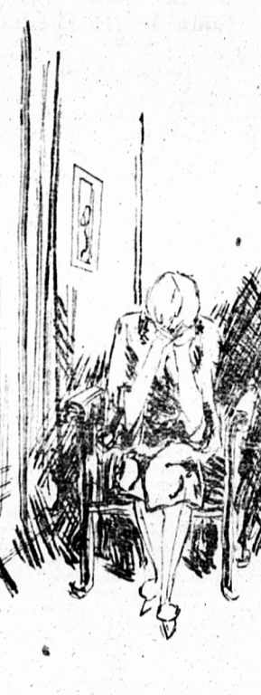
When the door had closed on Tim Myra turned Sally curiously

Myra's first feeling was a fine one. She thought of Sally and Sally's reaction. Since that night she had accused her on the boat of letting Allen Leigh make love to her she had come to a clearer understanding of Sally's childlike nature. And yet there were times when this very quality in her sister annoyed her. Being older and more experienced, she knew that men were drawn by Sally's native charm. It wasn't Sally's fault, and yet Myra could be vicious at times. Her second feeling was not so fine; it was one of hurt pride over a rather ordinary flirtation on her own part. "Well," she said with a sneer.