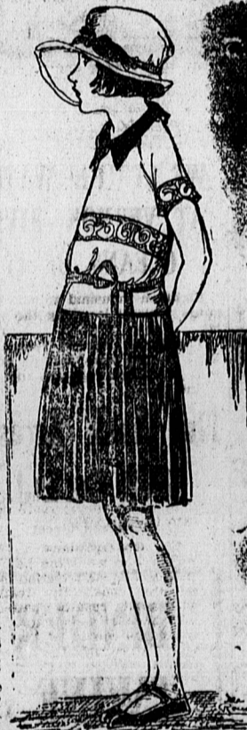
Simple Frock for a Flapper

Jersey is the most popular wool material and skirt of the serge. The new arrangement is very smart. Jersey for school dresses for children for the coming season. Color combinations are in high favor, white and navy, red and navy, tan and brown, and navy and tan being approved. A little frock may be of one color, with narrow pipings of the self fabric in contrasting color, or the two colors may be combined in about equal proportion—a skirt of one and blouse or waist of the other shade.