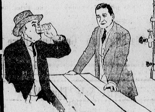
OH BOY THIS SODA HAS A KICK!

From the Famous Play, By Winchell Smith 7 - BIG ACTS - 7