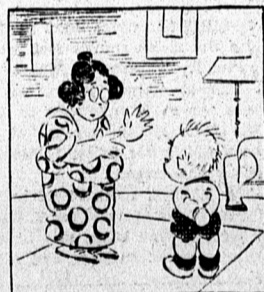
Mother: Willie, run and tell papa that dinner is most ready. Willie: Pop's just gone over to the drug store after some of them new dyspepsia tablets to be on the safe side.

BASEBALL When the green is back on the trees, And the mercury mounts in the shade, When the cherry blooms powder the breeze, And the moss growth lush in the glades; Tis the time when we tire of trade, When even the playhouses pall, And we rush from the side of a maid At the umpire's slogan, "Play ball!"