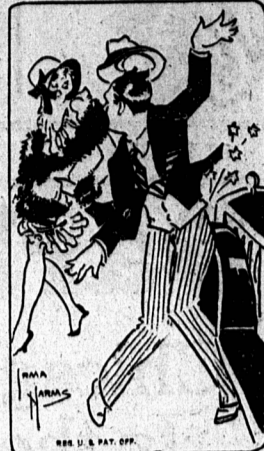
"A well-turned limb, a well-turned head—a man found bruised if he isn't found dead."