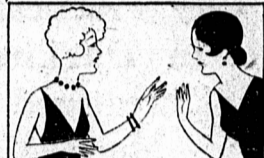
"I like George, but he is such a small man, I wish he was taller." "Well, it's better to have loved a short man than never to have loved a tall."