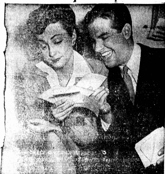
OLIVIA de HAVILLAND and ROBERT CUMMINGS — in an amusing scene from "Princess O'Rourke" the Warner screen comedy in which they are starred. Others in the cast are Charles Coburn, Jack Carson, Jane Wyman and Gladys Cooper.