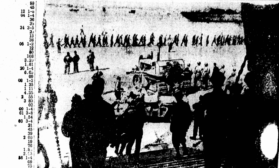
While Allied casualties who fell in Normandy down the beach in background, headed for ships awaiting them in the foreground, a long line of German prisoners tramp...