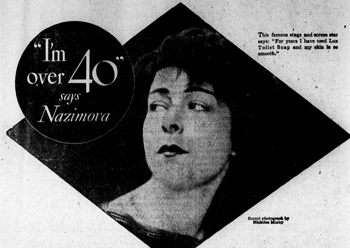
This famous stage and screen star says: "For years I have used Lux Toilet Soap and my skin is so smooth."

"ONLY the woman who looks it is afraid to admit her age," says Nazimova. "But I am proud of mine—I am over forty!" "It is easy to be lovely at sixteen, but to be still lovelier at forty . . . well, that is easy, too, if a woman is wise! Actresses rarely look their age, you notice. Like me, they guard their complexions with Lux Toilet Soap. "It is a marvel, that soap. For years I have been faithful to it—and my skin is so soft, so smooth." Nazimova is only one of countless stage and screen stars who use Lux Toilet Soap to guard complexion beauty. It is so gentle and beautifully white—as no soap less pure and carefully made could be! 9 out of 10 screen stars use it. Of the 694 important Hollywood actresses, including all stars, 686 use this fragrant white soap. That's why all the great film studios have made it their official soap!