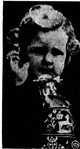
Prince of Naples, now 8, shown here at age of 2.

THE Special Correspondent writes from London. Monarchy, one of mankind's oldest institutions, faces the threat of extinction. A new republican tide is surging through Europe, whereas in the past it was confined to the Americas. Yesterday in Yugoslavia, today in Albania, tomorrow in Bulgaria, or Italy, or Greece, the monarchial and republican systems are being tested as never before. It is a process as steady and relentless as a glacier.