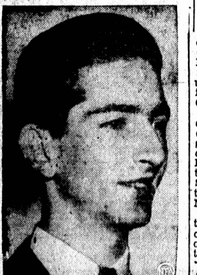
Peter II of Yugoslavia

Only in the northwestern corner of Europe has royalty still a sporting chance of survival. The countries in question are Great Britain, Norway, Sweden, Denmark, Belgium, the Netherlands, and Luxembourg. Those are the only parts in Europe where republicanism is weak or even virtually non-existent.