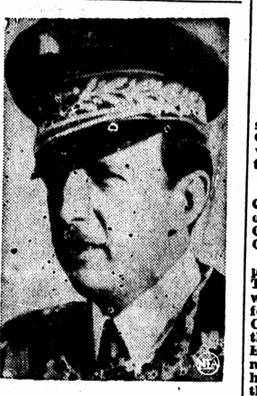
Zogu of Albania

Hybrid Hungary All told, there were still 15 sovereign rulers left in Europe (including the Princes of Liechtenstein and Monaco), when the Fascist dictators in 1939 took up king-busting. First to go into exile was King Zogu of Albania, followed shortly by King Haakon of Norway, Queen Wilhelmina of the Netherlands, Grand Duchess Charlotte of Luxembourg, King Peter of Yugoslavia, King George of Greece, and Carol II of Rumania. Today the crowned heads in Europe number less than a dozen, and several of these crowns sit very loosely. Yugoslavia and Albania have formally declared themselves republics, and it is likely they would do so tomorrow if permitted by the Allies. King