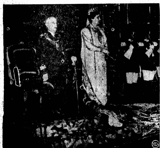
Italy's King Victor Emmanuel is reported ready to step down from the throne in favor of...

THE Special Correspondent writes from London. Monarchy, one of mankind's oldest institutions, faces the threat of extinction. A new republican tide is surging through Europe, whereas in the past it was confined to the Americas. Yesterday in Yugoslavia, today in Albania, tomorrow in Bulgaria, or Italy, or Greece, the monarchial and republican systems are being tested as never before. It is a process as steady and relentless as a glacier.