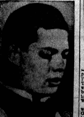
Michael of Rumania

Establishment of a republic here, a new dynasty being founded here, and so on. For a long time, the final outcome of the struggle was in doubt. Today it is a safe assumption that the monarchial system, from a long-range point of view, is doomed. Within the span of one life,