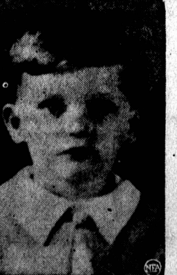
George of Greece

What is the reason for this concentration of monarchial sentiment in one comparatively small sector of the vast European Continent? Fundamentally it is that in those countries, which rank with the most highly civilized and enlightened in the world, many decades in some cases centuries ago, renounced most of its prerogatives, retaining only representative functions.