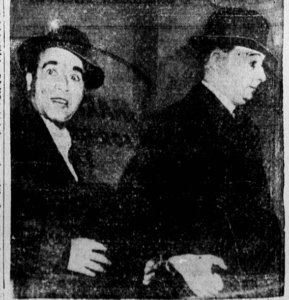
An assassin from India, not immediately identified, (left) handcuffed to detective leaving Caxton Hall in London after firing volley of revolver shots at meeting of the East India Association, March 13th. Killing Sir Michael O'Dwyer, former Lieut. Governor of Punjab, Lord Zetland, Secretary of State for India; Sir Louis Dane, former Secretary of the Government of India and Lord Lambington, former Governor of Bombay, were wounded. O'Dwyer was Governor of Punjab when British troops fired into a crowd of demonstrators, in 1919, killing 400 Indians and wounding more than 1,000.