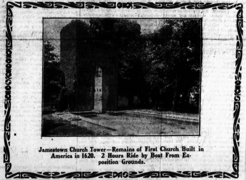
Jamestown Church Tower--Remains of First Church Built in America in 1620. 2 Hours Ride by Boat From Exposition Grounds.