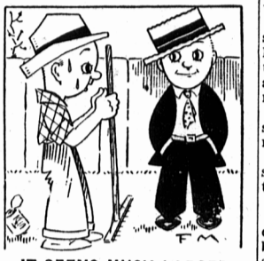
IT SEEMS MUCH LARGER "You think a square yard is three square feet, eh?"