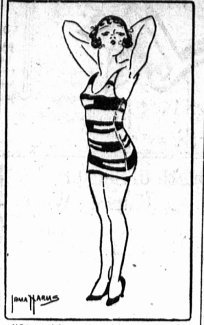
"Stretching the back exercises economy—if it's a greenback."