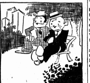
THEY'RE ALL PACKERS "Most of Chicago's citizens are in the packing business, aren't they?"