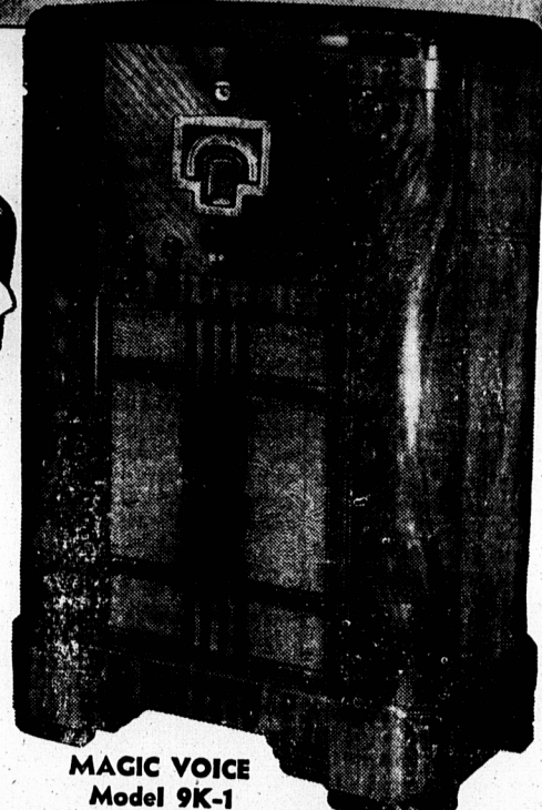
MAGIC VOICE Model 9K-1

Featured above is radio's most amazing value in the low-priced standard and short-wave field. This up-to-the-minute RCA Victor Globe Trotter Model 5T-5 is packed with advanced features. Exquisite walnut-veneered table cabinet. Wonderful world-wide performance! $69.00